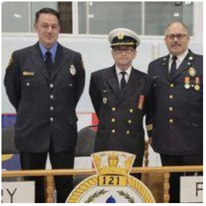
Photo 6. Firefighters attending the RCSCC 121 Mary Rose 70<sup>th</sup> Annual Ceremonial Review.