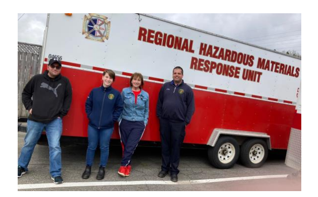
<u>Photo 9.</u> Firefighters attending the Training School in Grand Falls-Windsor.