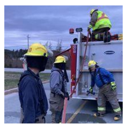
<u>Photo 4</u>. Firefighters conducting hose testing and training.