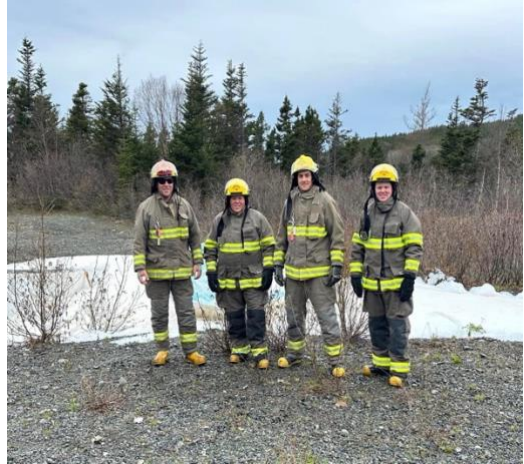
<u>Photo 8.</u> Firefighters attending the Marine Firefighting for Land-Based Firefighters course.