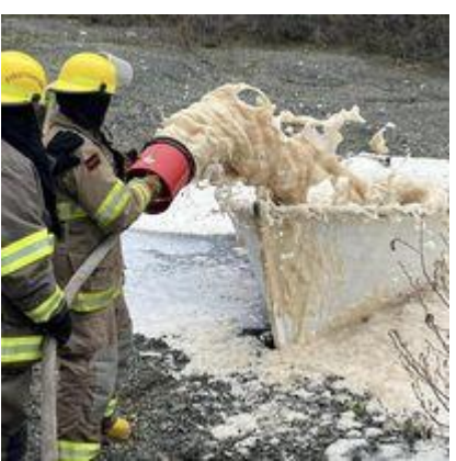
<u>Photo 7</u>. Firefighters training in Marine Firefighting for Land-Based Firefighters.