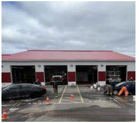
<u>Photo 2.</u> Firefighters washing cars at the Department's car wash fundraiser.