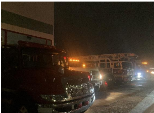
Photo 14. Pre-Incident planning at Marbase.