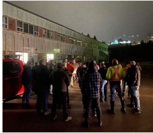
Photo 15. Pre-Incident planning at Marbase.

*The Marystown Volunteer Fire Department serves approximately 5,400 residents from the centrally located Fire Hall at 97-105 McGettigan Boulevard. The Fire Department has 30 very dedicated firefighters and a fleet of a Fire Chief's Vehicle (Unit #1), 1 Ladder Truck (Ladder #1), 2 Pumpers (Engine's #2 & #3), 2 Rescue Vehicles (Rescue's #4 & #6), 1 Pick-up Truck (Mobile #5), a Hovercraft (Rescue #1) & Antique Pumper (Engine#1). Visit our website at www.marystownvolunteerfiredept.com , or you can also visit us on Facebook at www.facebook.com/MystVolFireDept and Twitter @MYSTVolFireDept.*