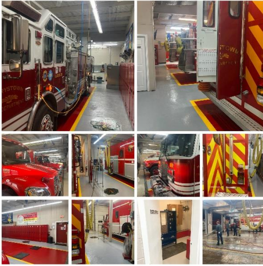
Photo 11. Our Apparatus Bay received a much-needed upgrade.