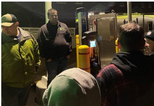
Photo 13. Pre-Incident planning at the Marystown Hotel.