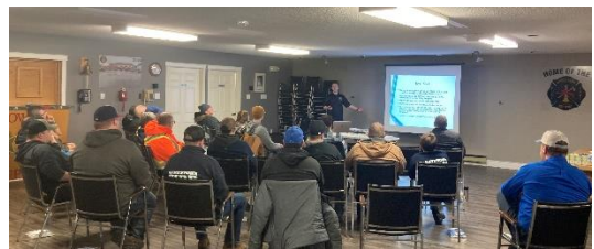
Photo 6. Electric/Alternative Fuel Vehicle awareness session.