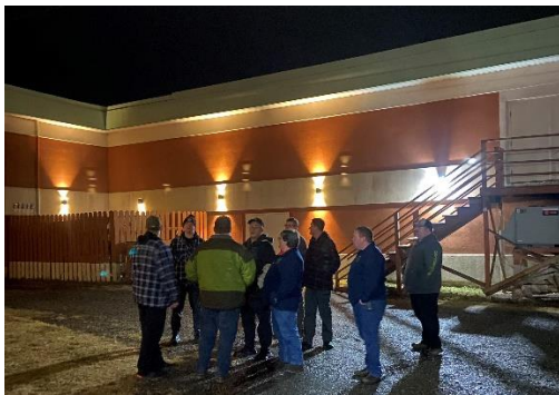
Photo 12. Pre-Incident planning at the Marystown Hotel.