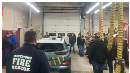
Photo 7. Electric/Alternative Fuel Vehicle awareness session.