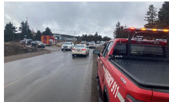
Photo 2. MVA on Creston Boulevard.