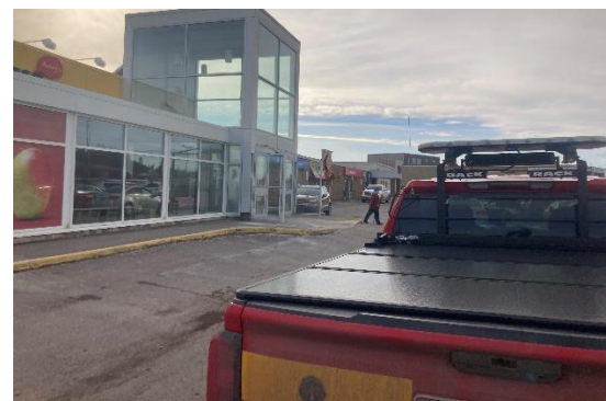
Photo 3. False alarm at the Marystown Mall.