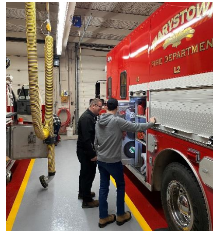
Photo 9. Members completing maintenance and inventory on Rescue #4.