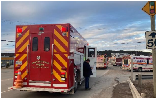
Photo 4. MVA at the McGettigan Boulevard/Ville Marie Drive/Harris Drive intersection.