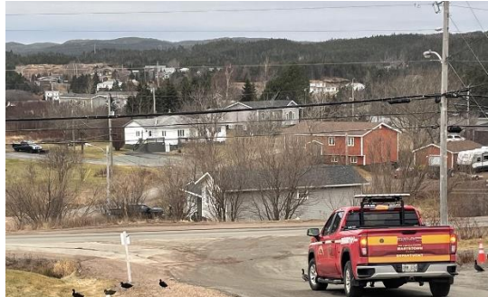
Photo 5. Report of fire/smoke on Creston Boulevard.