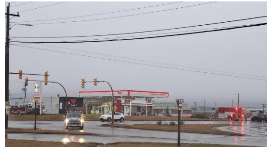
Photo 1. Smell of smoke at KFC.

As a Department and as individuals, we are always continuing our training so we can best serve you. Best wishes to all and thank you for taking the time to read our newsletter!