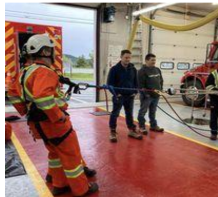
Photo 8. Firefighters training in Rope Rescue.