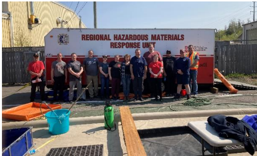
Photo 1. Hazardous Materials Class at Fire School.

Before arrival of any units at the location, we received notification confirming a false alarm. Ladder #1, Engine #3 and Rescue #4 were stood down.