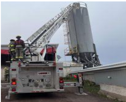
Photo 3. Ladder Operations Training.