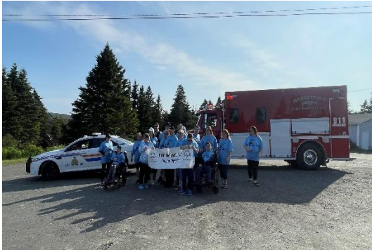
Photo 10. Participating in the Torch Run.