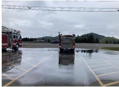
Photo 5. Annual Pumper and Ladder Truck Inspections.