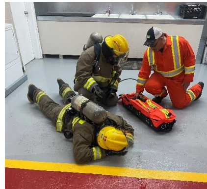
Photo 7. Firefighters practicing RIT exercises.