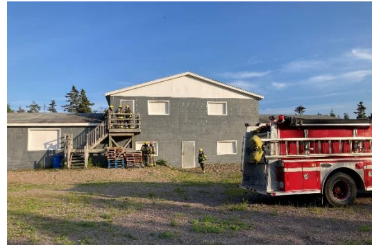
Photo 13. Smokehouse Scenarios.