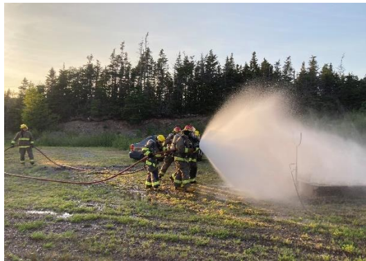
Photo 11. Firefighters learning how to extinguish pressurized fuel fires.