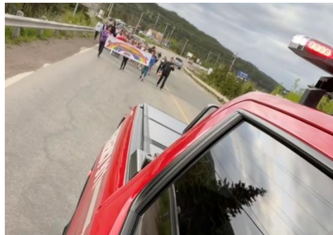
Photo 6. Participating in the Pride Parade.