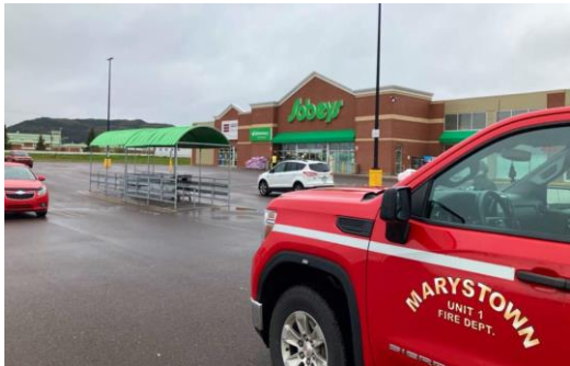
Photo 2. Sobeys' Annual Fire Drill.