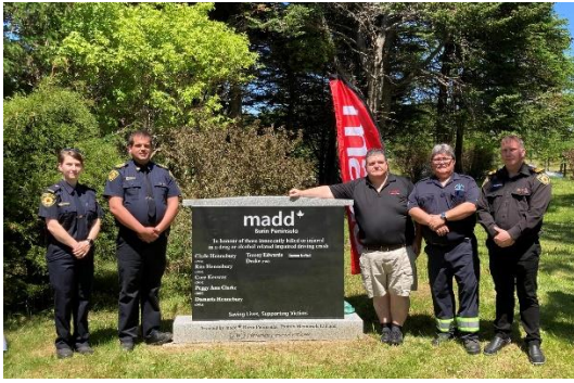
Photo 9. Attending the MADD Service.