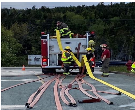
Photo 4. Continuing annual hose testing.