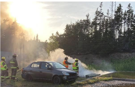
Photo 12. Training on fuel fires with Fire Extinguishers.

*The Marystown Volunteer Fire Department serves approximately 5,400 residents from the centrally located Fire Hall at 97-105 McGettigan Boulevard. The Fire Department has 30 very dedicated firefighters and a fleet of a Fire Chief's Vehicle (Unit #1), 1 Ladder Truck (Ladder #1), 2 Pumpers (Engine's #2 & #3), 2 Rescue Vehicles (Rescue's #4 & #6), 1 Pick-up Truck (Mobile #5), a Hovercraft (Rescue #1) & Antique Pumper (Engine#1). Visit our website at www.marystownvolunteerfiredept.com , or you can also visit us on Facebook at www.facebook.com/MystVolFireDept and Twitter @MYSTVolFireDept.*