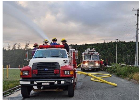
Photo 20. Pump Operations training with Relay Pumping.