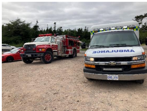
Photo 7. MVA off of Route 220.