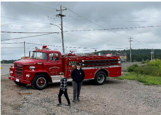
Photo 18. Engine #1 at the Colonial Auto Parts' customer appreciation car show.

*The Marystown Volunteer Fire Department serves approximately 5,400 residents from the centrally located Fire Hall at 97-105 McGettigan Boulevard. The Fire Department has 30 very dedicated firefighters and a fleet of a Fire Chief's Vehicle (Unit #1), 1 Ladder Truck (Ladder #1), 2 Pumpers (Engine's #2 & #3), 2 Rescue Vehicles (Rescue's #4 & #6), 1 Pick-up Truck (Mobile #5), a Hovercraft (Rescue #1) & Antique Pumper (Engine#1). Visit our website at www.marystownvolunteerfiredept.com , or you can also visit us on Facebook at www.facebook.com/MystVolFireDept and Twitter @MYSTVolFireDept.*