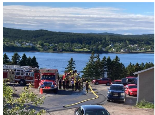
Photo 5. Structure Fire on Tolt Road.