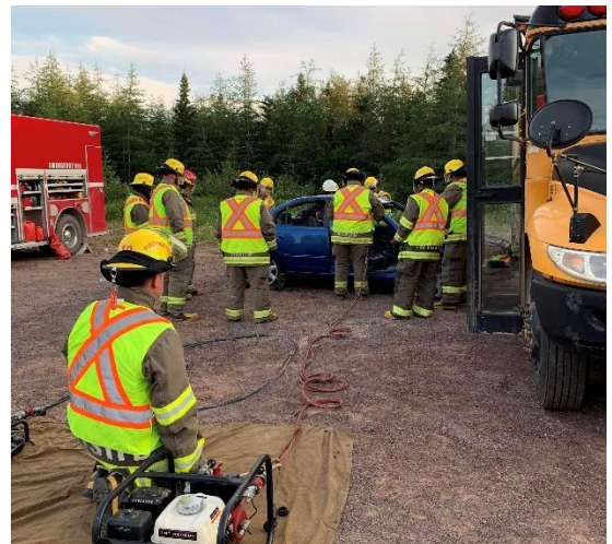
Photo 15. Vehicle Extrication training during the session with the Burin Fire Department.