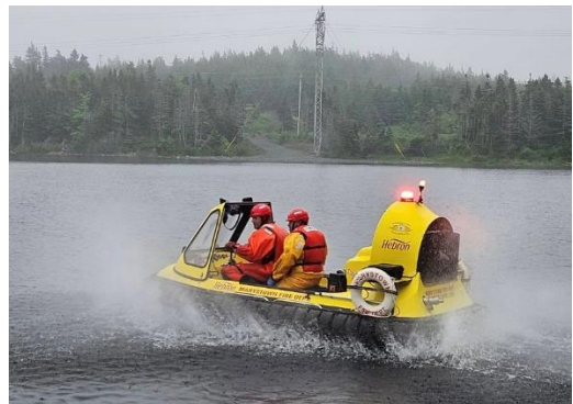
Photo 4. Hovercraft Operations training on Linton Lake.