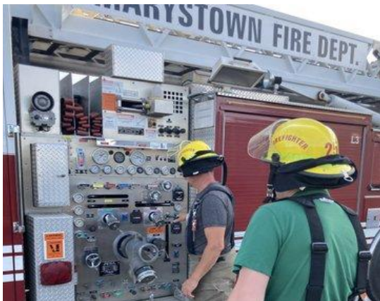
Photo 12. Firefighters reviewing Pump Operations for the Ladder truck.