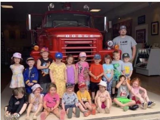
Photo 11. Explore and Discover Preschool Groups visit to the Fire Hall.