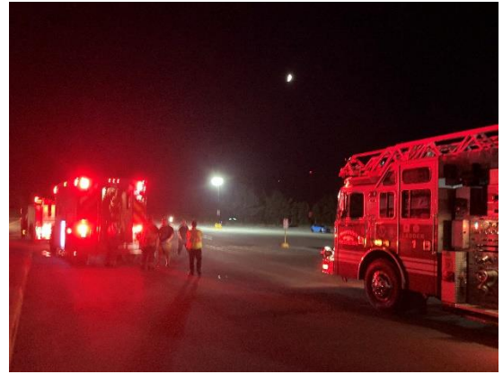
Photo 13. Fire Alarm activation at the Peninsula Mall on Columbia Drive.