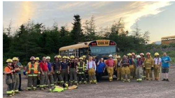
Photo 14. Marystown and Burin Volunteer Fire Departments training together.