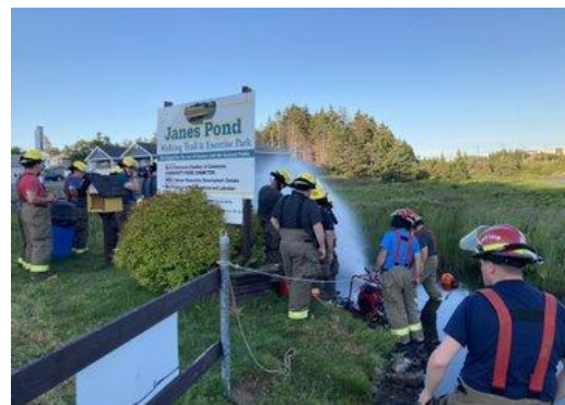
Photo 8. Firefighters training alongside Forestry.