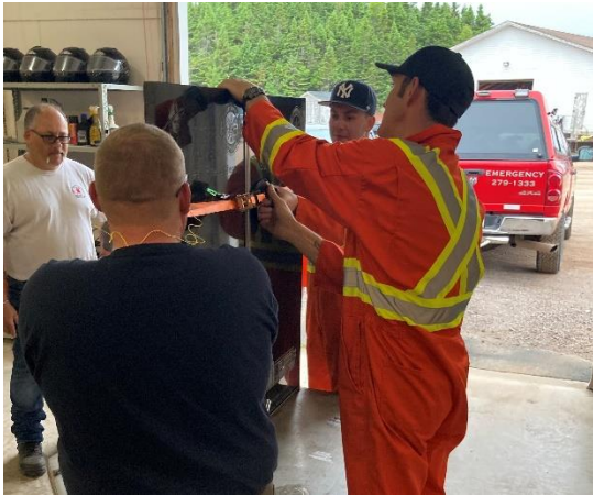
Photo 10. The Heritage Committee continuing at the Memorial Monument upgrading project.