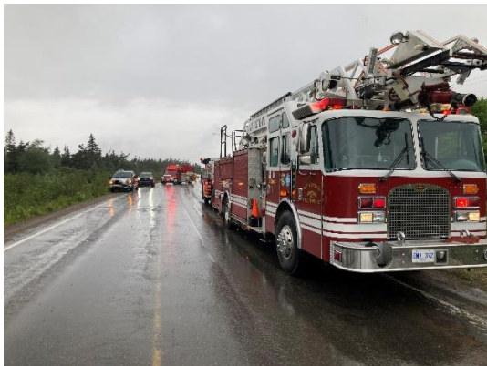
Photo 17. MVA on Route 220.