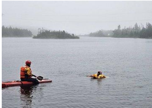
Photo 3. Firefighters practicing Water Rescues on Linton Lake.