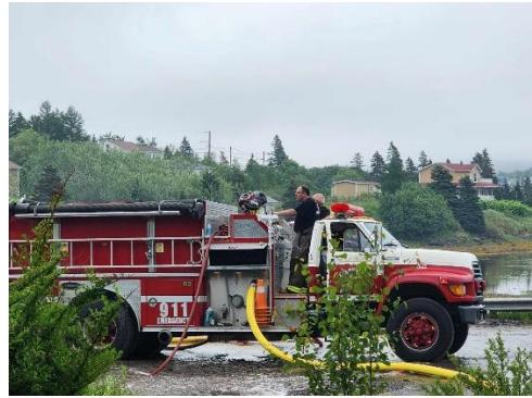
Photo 6. Structure Fire on Ville Marie Drive.