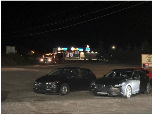
Photo 16. Returning from a MVA on Route 210, north of Marystown.