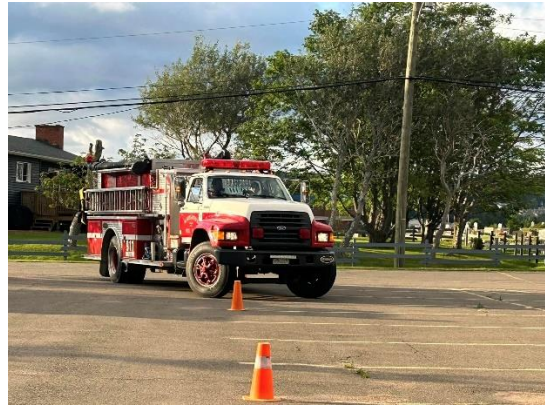
Photo 19. Driver-Operator training.