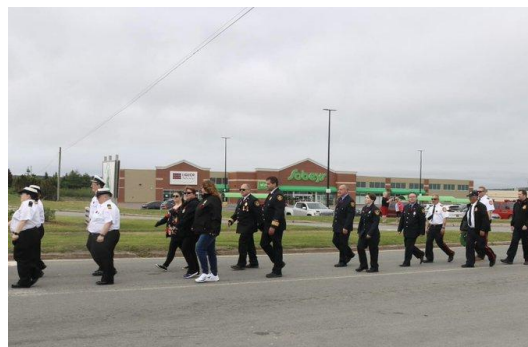
Photo 1. Firefighters took part in the Canada/Memorial Day parade and service.

Thank you to our members for your dedication and your continued service to the community!