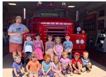
Photo 13. Another group visit from Explore and Discover Daycare.