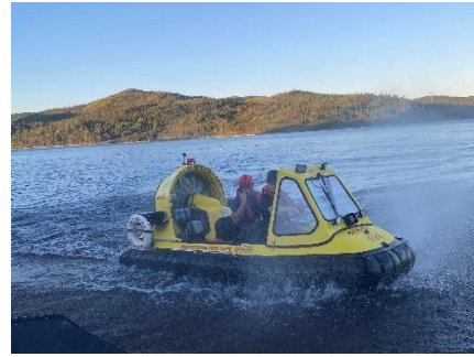
Photo 2. Hovercraft Operations Training.