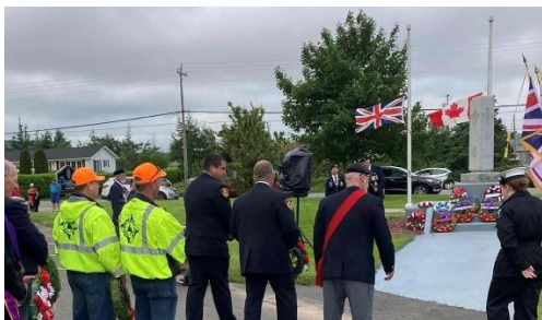
Photo 1. Canada/Memorial Day Service.

It's been a hot and dry summer! With that in mind, please continue to monitor the daily fire ratings set by Forestry and adhere to the regulations. When the fire ratings are very high or extreme, outdoor fires including backyard fires are not permitted. Your cooperation and understanding is much appreciated!