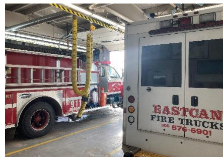
Photo 5. Annual Ladder and Pump servicing/testing.