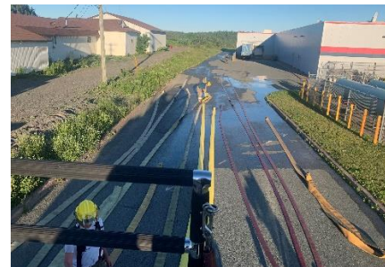
Photo 4. Annual Fire Hose Testing.