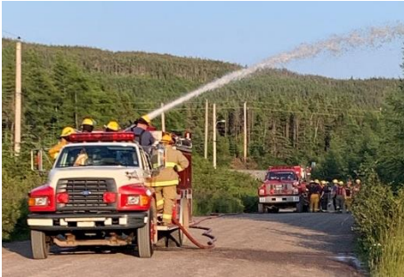
Photo 8. Joint Training Drill with the Burin Fire Department.