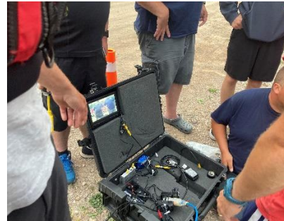
Photo 12. Training with our Underwater Camera.