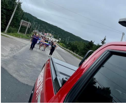
Photo 15. Escorting the Pride Parade.

*To schedule a demonstration, presentation or tour, call us at (709)279-2226 or email marystownfiredepartment@outlook.com *