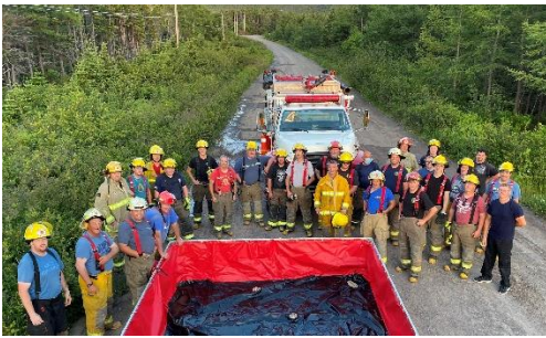
Photo 9. Joint Training Drill with the Burin Fire Department.