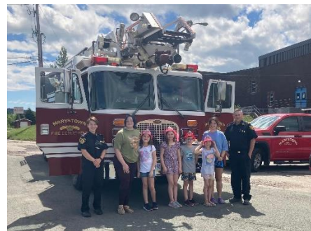
Photo 14. Visit to the French Kids Summer Camp.