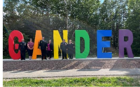
Photo 11. Our delegates and partners at the NLAFS Convention.