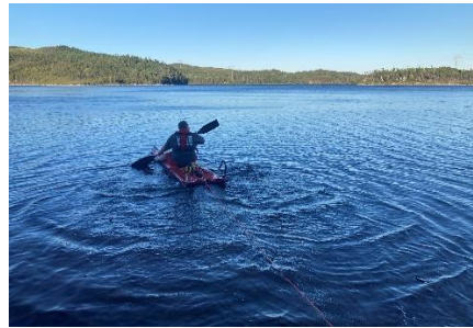
Photo 3. Water Rescue Training.