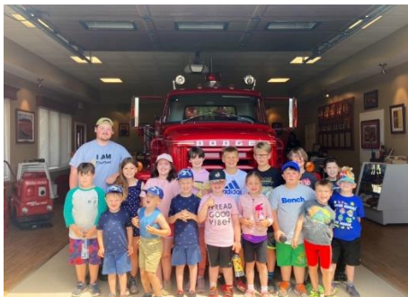
Photo 10. Group visit from Explore and Discover Daycare.