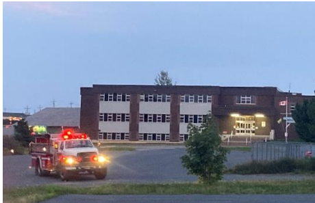
Photo 14. Driver-Operator training.