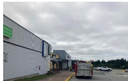
Photo 12. Fire Alarm at Peninsula Mall.