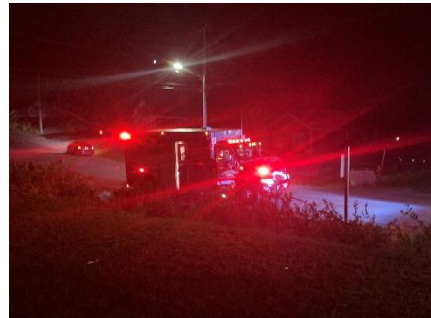
Photo 2. Structure Fire on Dock Point Road.