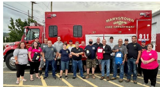
Photo 20. New Rope Rescue Equipment presentation, followed by training.