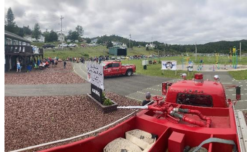
Photo 10. Participation in the Wheels for Wishes.