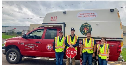
Photo 18. Traffic Control for the Route 210 Ride.