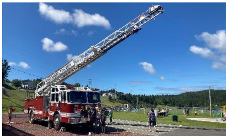
Photo 8. Participation in the Come Home Year Family Day.