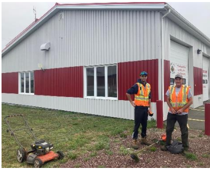
Photo 5. Thank you to the summer maintenance crew.