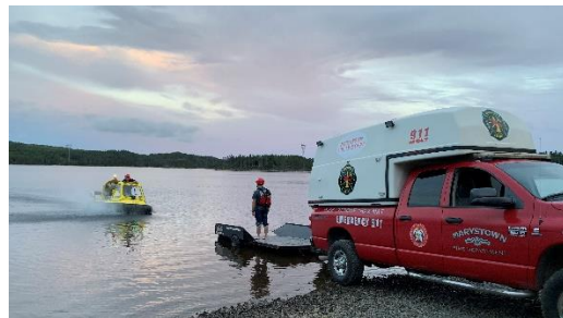
Photo 21. Hovercraft Operations and Water Rescue training.