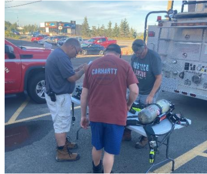
Photo 1. Equipment Maintenance and Inspections.

To finish off a busy month, we were glad to be out in the community supporting the local swim team on their Motorcade Wednesday, August 31 st after returning from Provincials. Congratulations to the Marlins on a successful season!