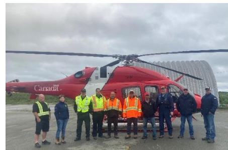
Photo 3. Assistance with the transport of goods to the South Coast.