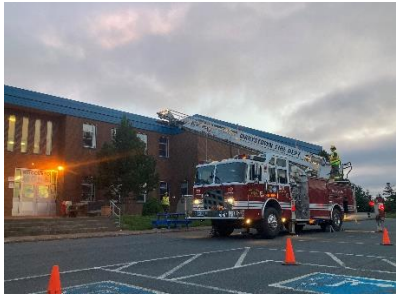
Photo 13. Ladder Operations Training.