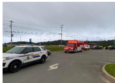
Photo 22. Participation in the Marlins Swim Team motorcade.