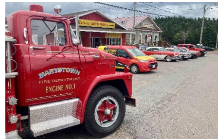
Photo 19. Colonial Customer Appreciation Day.