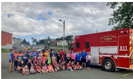
Photo 17. Smallwood Crescent Community Center's Back to School Fun Day.