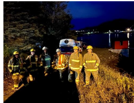
Photo 11. The crew at the Come Home Year Fireworks Show.