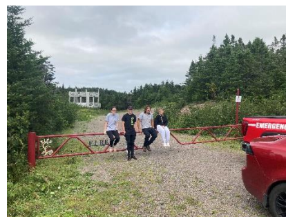
Photo 4. Thank you to the Green Team.